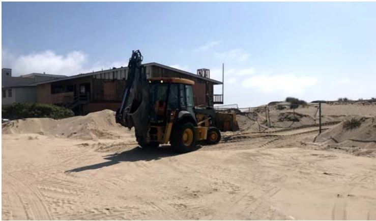
Parking Lot Sand Clearing